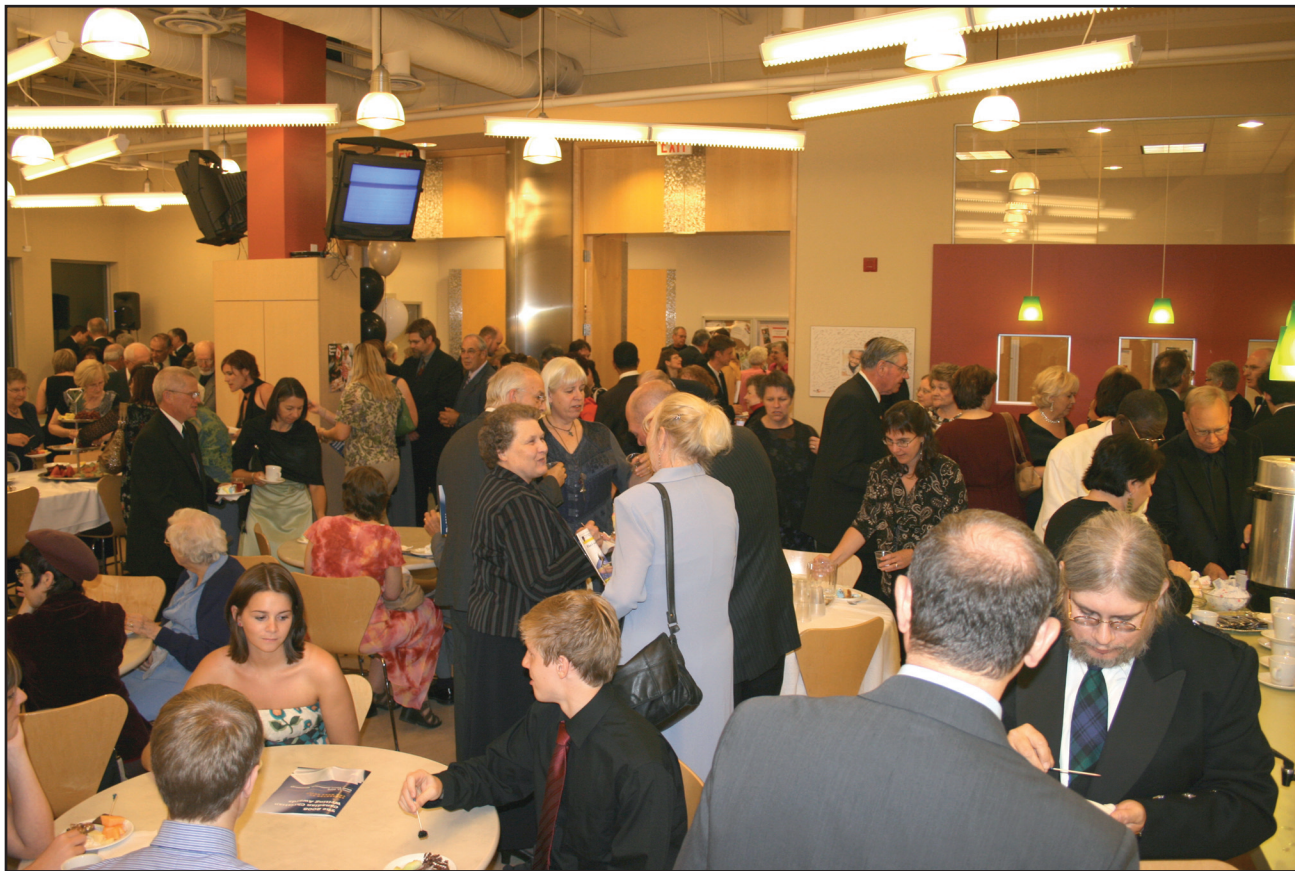
Readers, writers, publishers, editors, family and friends gather at the post-Gala reception to celebrate sharing the Good News through writing at The 2008 Canadian Christian Writing Awards.

Annual awards picks the winners of best writers in books, news articles, screenplays and more